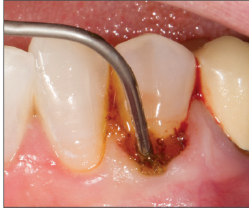
Astringedent X hemostatic is rubbed firmly against bleeding tissue.