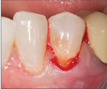
Bleeding at preparation.

ASTRINGEDENT X HEMOSTATIC IS YOUR FIRST STEP IN ACHIEVING GREAT FITTING CROWNS, BRIDGES, VENEERS, AND TEMPORARIES. IT IS AVAILABLE IN 30 ML BOTTLES, INDISPENSE™ SYRINGES, AND NOW PREFILLED 1.2 ML SYRINGES.