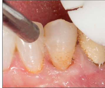
When bleeding stops, give a firm air/water spray to test for hemostasis and remove coagulum.